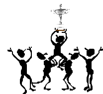
Best of luck to the 2003 Wright Cycledelics!

Any & all comments, suggestions, & story ideas are greatly appreciated! Please see mailer portion of this newsletter for contact information. Thanks!